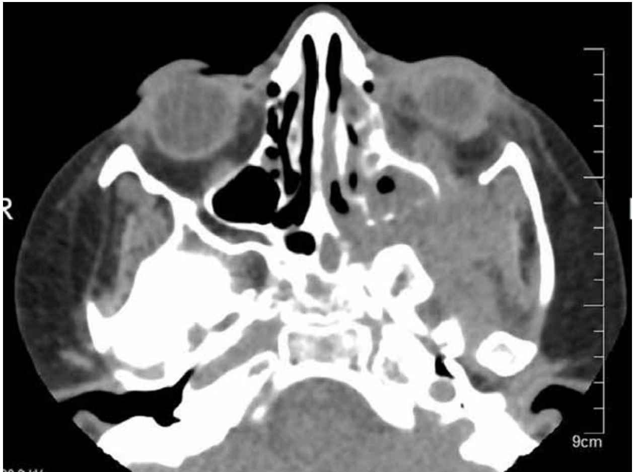
Figure 1. CT scan image shows a soft tissue mass in the left infratemporal fossa extending to pterygopalatine fossa via pterygomaxillary fissure, sphenopalatine foramen and to left orbit.