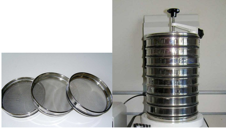
Figure 01. Set of sieves for soil aggregates determination

Measurements and calculations: The co-efficient of vulnerability was calculated by the following formula (Rohoskova and Valla (2004):