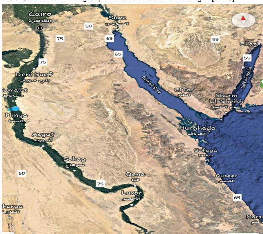
Fig.1 Map show the studied area [Quseir city, Red Sea, Egypt]

The fresh algal species were collected from the inter-tidal region of Quseir city (Figure 1) which located on the west coastal area of Red Sea shore between longitude 34° 17'E and latitude 26° 06'N during the spring year 2015. Collected sample was immediately brought to the laboratory in new plastic bags containing pond water to prevent evaporation. Algal material was washed thoroughly with tap water and distilled water to remove extraneous materials and shade-dried for 5 days and oven dried at 60°C until constant weight was obtained, then was grind into fine powder using electric mixer and stored at 4°C for future use. Algal species were identified according to [17-20].