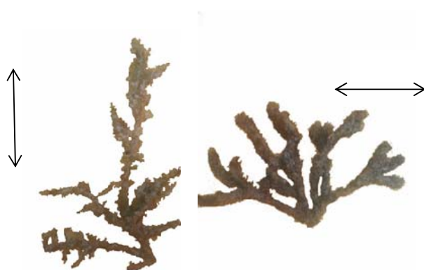
Figure 2. Acanthophora spicifera Figure 3. Digenea simplex

Isolated algal species: Two algal samples of red algae Acanthophora spicifera (M. Vahl) Borgese(Fig.2)and Digenea simplex (Wulfen) C.Agardh(Fig.3)were collected from Red Sea, Egypt(Quseir city).