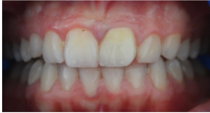
Figure 4: Retracted close-up postoperative view of the maxillary anterior restoration