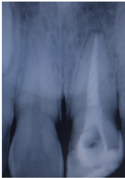
Figure 2: Radiological examination