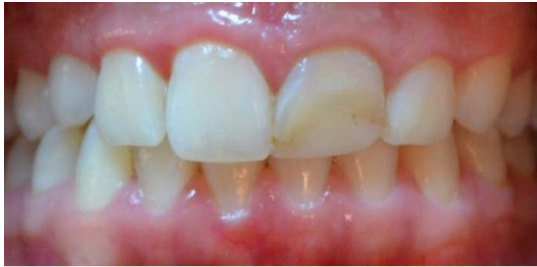
Figure 1: Retracted preoperative full-mouth view showing discolored margins of resin